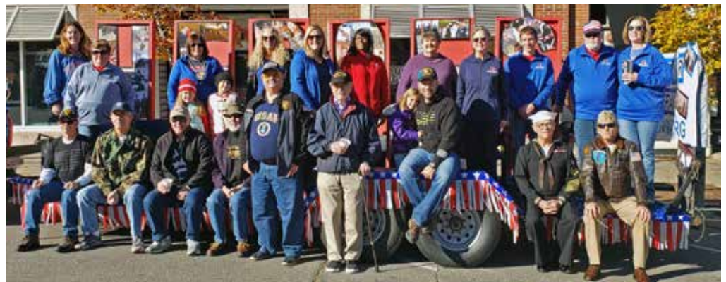
Pictured above: VNA staff, volunteers, and Veterans pose with the VNA We Honor Veterans Float before the 2019 Lawrence Veterans Day Parade.

Veterans to ride on and walk along-side the float.