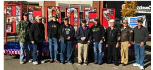
Pictured above: Veterans rode on and walked beside the VNA float for the parade.

Veterans to ride on and walk along-side the float.