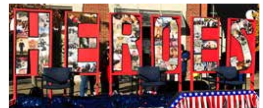
Pictured above: The VNA We Honor Veterans parade float.

The 2019 Lawrence Veterans Day Parade started making its way down Massachusetts Street at 11:00 a.m. on November 9. It was a beautiful, sunny Saturday morning that made for the perfect conditions to honor local Veterans. VNA's float received excellent feedback from the parade attendees. VNA plans to take part in this wonderful event again in 2020 to continue to honor Veterans.