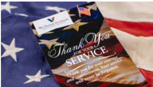
Pictured above: The card and pin that is presented to Veterans in the pinning ceremony.

How do you adequately honor a hero? There doesn't seem to be an easy answer to that question, but Visiting Nurses' staff members are doing their best to honor heroes in any way they can. Visiting Nurses' Hospice program is uniquely positioned to honor Veterans one final time in their lives. Through a partnership with the We Honor Veterans campaign, VNA's Hospice program is committed to identifying patients with military experience, increasing their access to Veteran services, providing Veteran-centric education for staff and volunteers, focusing on recruiting new volunteers with military backgrounds to serve Veteran patients and by honoring those patients through formal acknowledgment ceremonies.