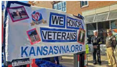
Pictured above: Two Veterans stand near the VNA parade float before the Lawrence Veterans Day Parade.

In addition to VNA's regular efforts to honor Veterans, VNA's staff recently honored local Veterans by participating in the 2019 Lawrence Veterans Day Parade. "The