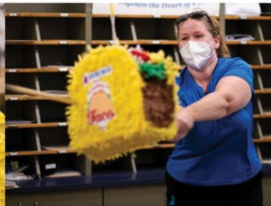
Pictured above: VNA's Home Health team celebrated the fantastic accomplishment of having back-to-back deficiency-free Home Health State Surveys (2018, 2022).